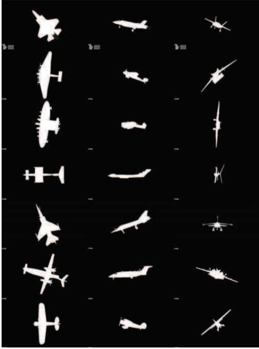
Fig. 3: Poses of different types of aircrafts.

93.5% of success with the PCR5-based SMF-ATR. In term of computational time, it takes between 5ms and 6ms to process each image in the sequence with no particular optimization of our simulation code, which indicates that this SMF-ATR approach is close to meet the requirement for real-time aircraft recognition. It can be observed that PCR5-based SMF-ATR outperforms DS-based SMF-ATR for 3 types of aircraft and gives similar recognition rate as with DS-based SMF-ATR for other types. So PCR5-based SMF-ATR is globally better than DS-based SMF-ATR for our application.